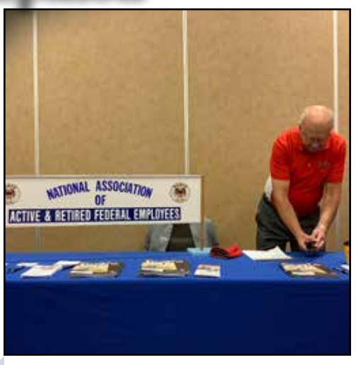
NARFE keeps us in the loop on the federal employee sector