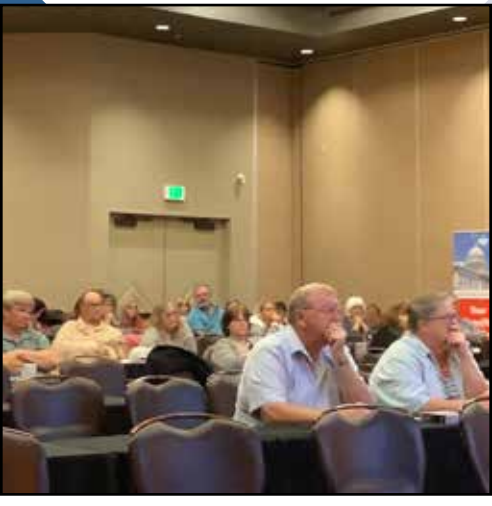
Federal Injury Centers gave us a wealth of knowledge on OWCP