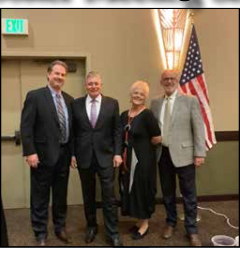
MyFedRetirementWerks gave helpful advice on retirement