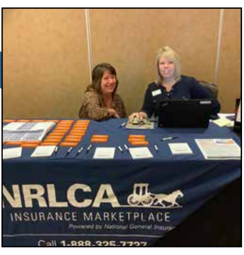
Got insurance? National General may get you a better rate