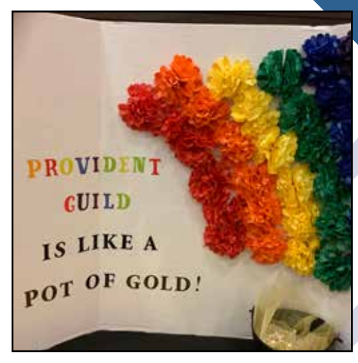
Provident Guild can help your family in a certain time of need