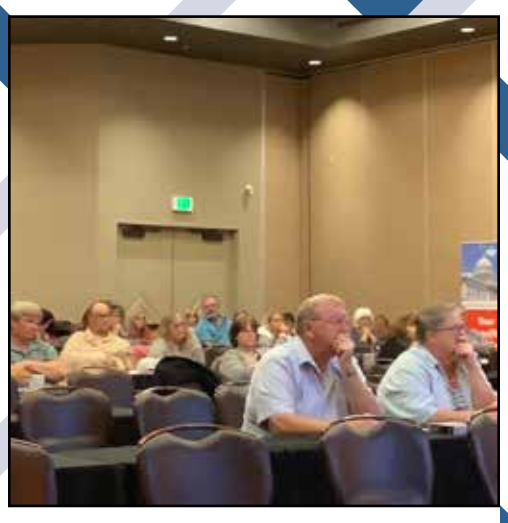
Attendees are immersed in a variety of educational material