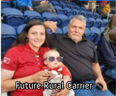
Future Rural Carrier