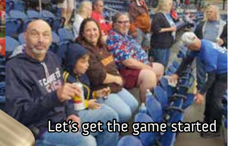
Let's get the game started