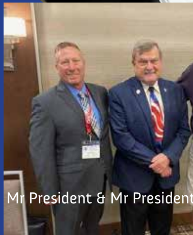
Mr President & Mr President