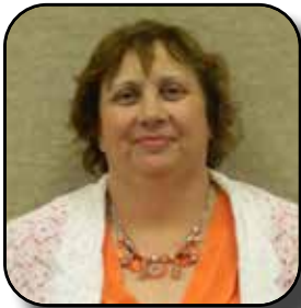
Catherine Funderburgh District Representative Ohio 1 and Ohio 2 Districts