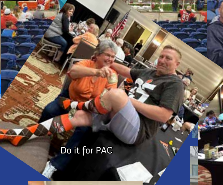
Do it for PAC