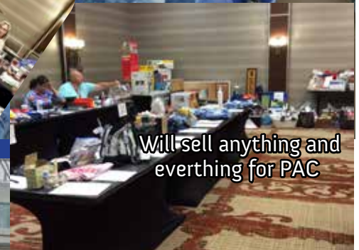
Will sell anything and everthing for PAC