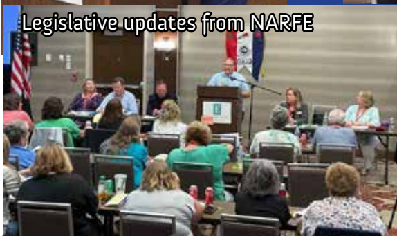
Legislative updates from NARFE