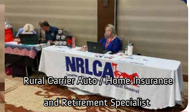
Rural Carrier Auto / Home Insurance and Retirement Specialist