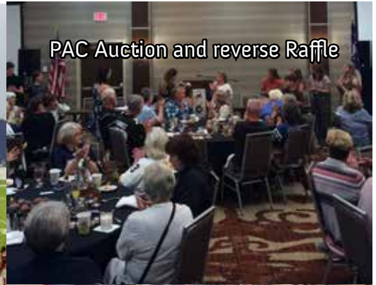
PAC Auction and reverse Raffle