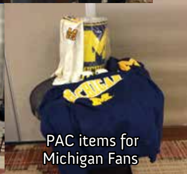
PAC items for Michigan Fans