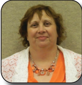
Catherine Funderburgh District Representative Ohio 1 and Ohio 2 Districts